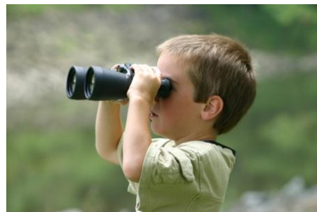
"B" is for binoculars!

We are off to a fantastic start in our Afternoon Explorers program. We will continue exploring the alphabet with fun, hands-on activities. November will include outdoor "D"iscovery, literacy activities, science "E"xperiments, exercise, talking about our "F"eelings and much more. Come explore with us!